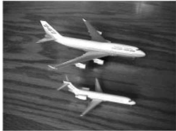
Fig. 2. Accurate scaled models of the Boeing 717 and 747.

Ask students to estimate the power of a commercial jetliner. Students need some basic data to properly respond, and such data for both commercial and military aircrafts can be found at www.boeing.com . For example, specifications for the Boeing 747-400ER, the largest in the 700 series jetliners in production, are: W_{\max} = 910,000 \text{ lb}_f , V_{\text{cruise}} = 567 \text{ mph} at 35,000 ft, engine thrust = 63,300 \text{lb}_f . Therefore, for this aircraft, the power to takeoff and reach the cruising altitude in about